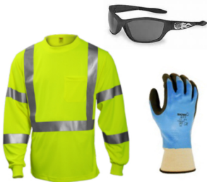
Safety - FR Clothing