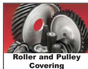
Roller and Pulley Covering