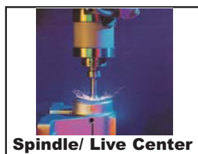
Spindle/ Live Center