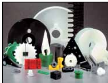
Plastic & UHMW Shapes