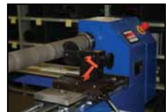
Optibelt Synch Belts