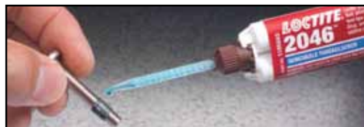
Loctite Food Grade Threadlocker