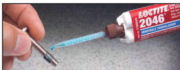
Loctite Food Grade Threadlocker