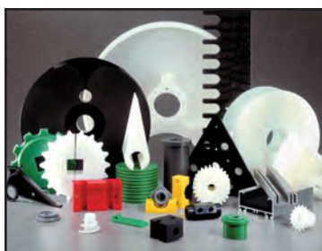
Plastic & UHMW Shapes